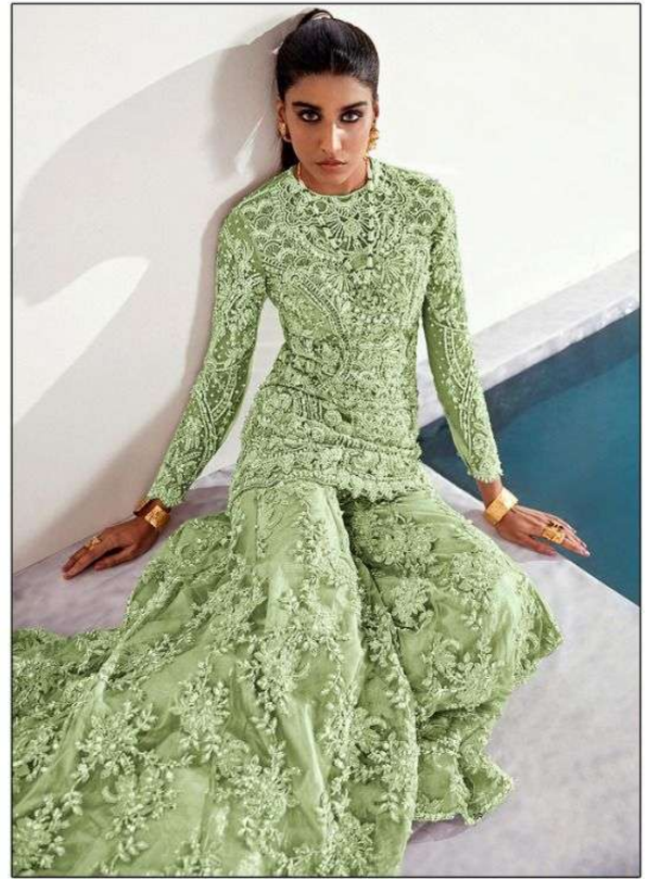
TOP - BUTTERFLY NET HEAVY EMBROIDERED UNSTITCH T/B INNER - HEAVY SANTOON BOTTOM - BUTTERFLY NET HEAVY EMBROIDERED DUPATTA - BUTTERFLY NET HEAVY EMBROIDERED