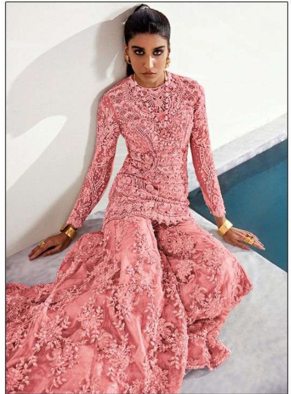
TOP - BUTTERFLY NET HEAVY EMBROIDERED UNSTITCH T/B INNER - HEAVY SANTOON BOTTOM - BUTTERFLY NET HEAVY EMBROIDERED DUPATTA - BUTTERFLY NET HEAVY EMBROIDERED