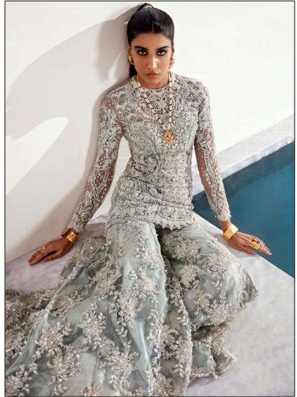
TOP - BUTTERFLY NET HEAVY EMBROIDERED UNSTITCH T/B INNER - HEAVY SANTOON BOTTOM - BUTTERFLY NET HEAVY EMBROIDERED DUPATTA - BUTTERFLY NET HEAVY EMBROIDERED