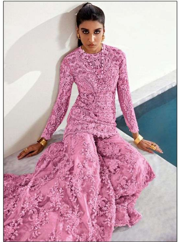
TOP - BUTTERFLY NET HEAVY EMBROIDERED UNSTITCH T/B INNER - HEAVY SANTOON BOTTOM - BUTTERFLY NET HEAVY EMBROIDERED DUPATTA - BUTTERFLY NET HEAVY EMBROIDERED