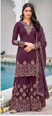
▶ 1314 ◀