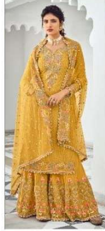
▶ 1317 ◀