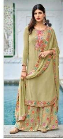
▶ 1318 ◀