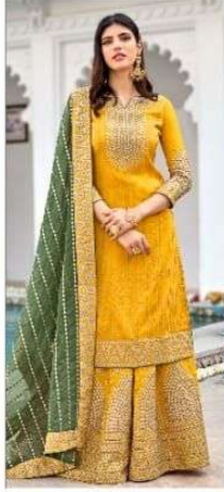
▶ 1315 ◀