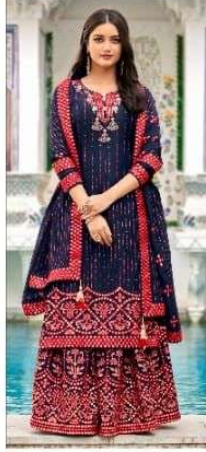
▶ 1316 ◀