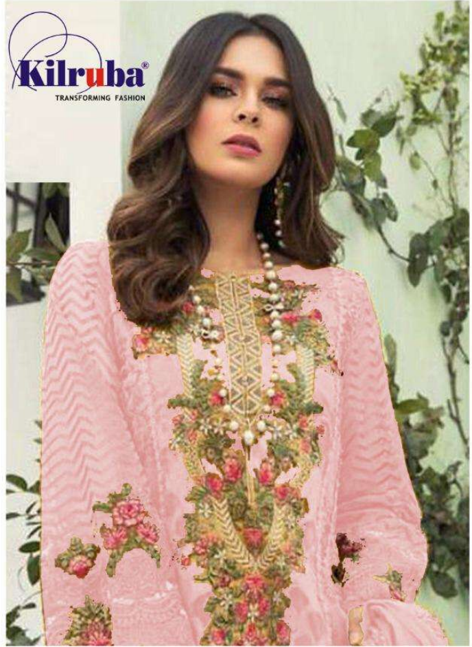
K - 56 F