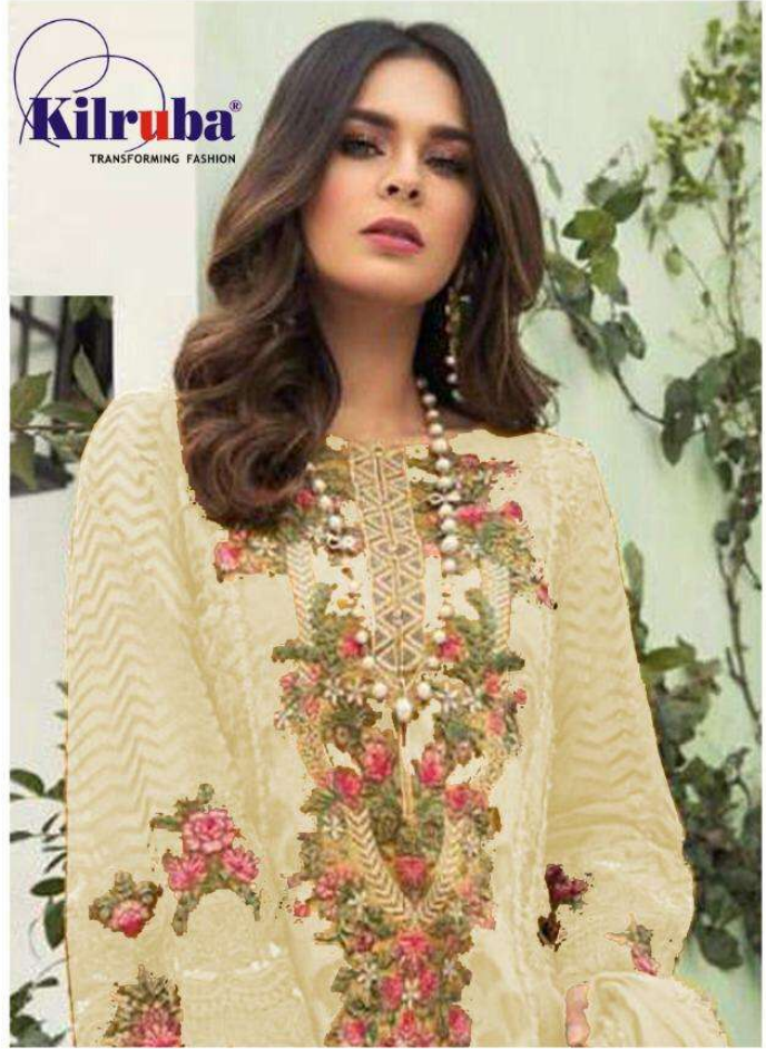
K - 56 C