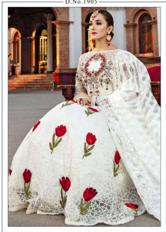
TOP- FOX GEORGETTE WITH EMBROIDERY WORK BOTTOM+INNER - HEAVY SHANTUN DUPATTA - NAZNI EMBROIDERY WORK