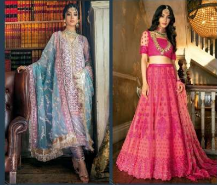
Design Number 3004