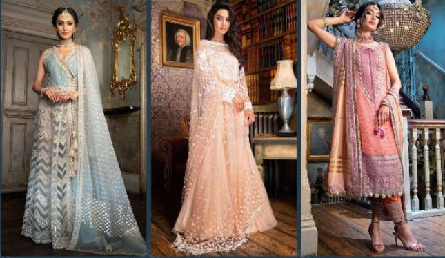
Design Number 3001