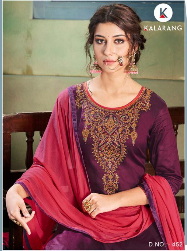
KESSI KALARANG BLOSSOM VOL 3