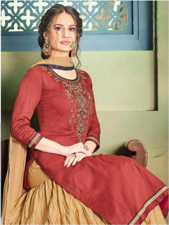
KESSI KALARANG BLOSSOM VOL 3