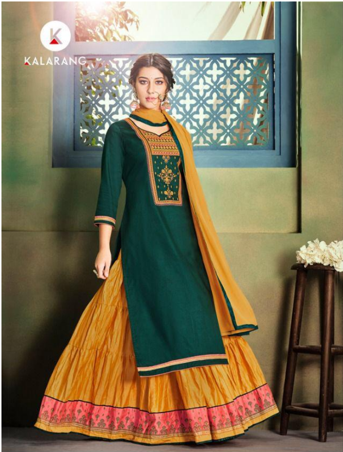
KESSI KALARANG BLOSSOM VOL 3