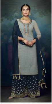
D. NO : 1045