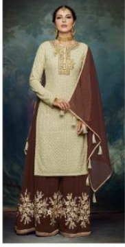
D. NO : 1046