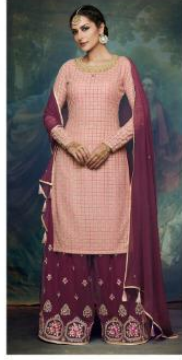
D. NO : 1047