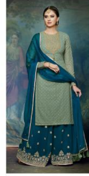
D. NO : 1050