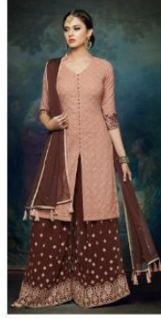
D. NO : 1048