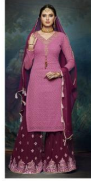
D. NO : 1049