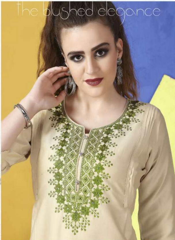
Beautiful myriad of colours for the celebration of upcoming festive season for the stunning & beautiful Ladies of all ages keeping in mind the affordability factor.