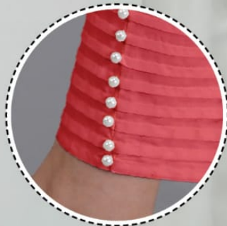
Pearl Beads with Pintex Work