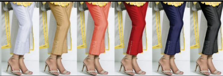
White Golden Peach Red Navy Black

LATEST FASHION • HI-QUALITY • LOWEST PRICE