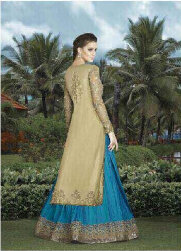
D.no. 4901 B