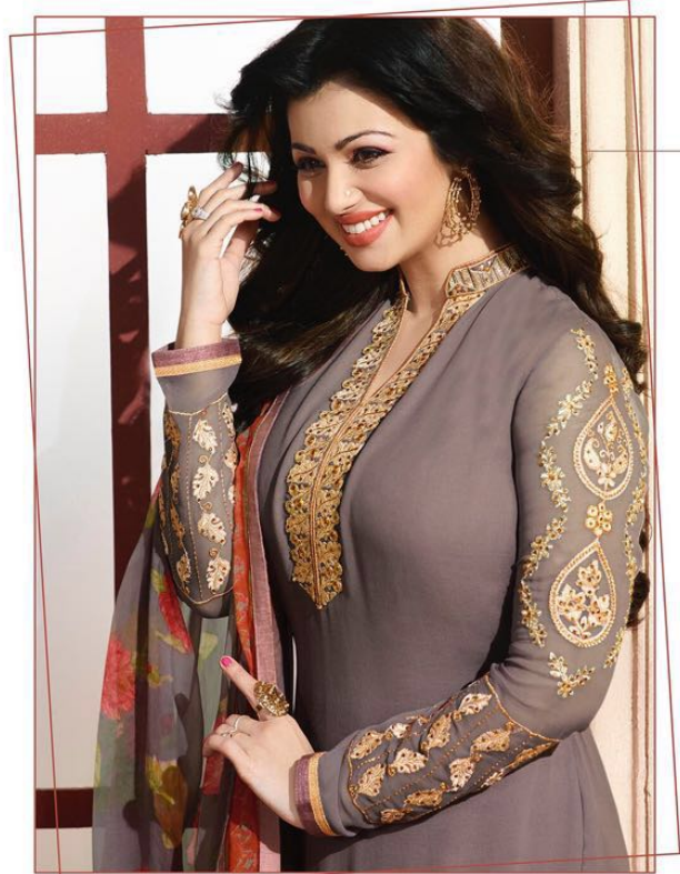
Collection is based on evening COCKTAIL wear, it is not TRADITIONAL , It is YOUNG & STYLIZED . D.NO.:12504